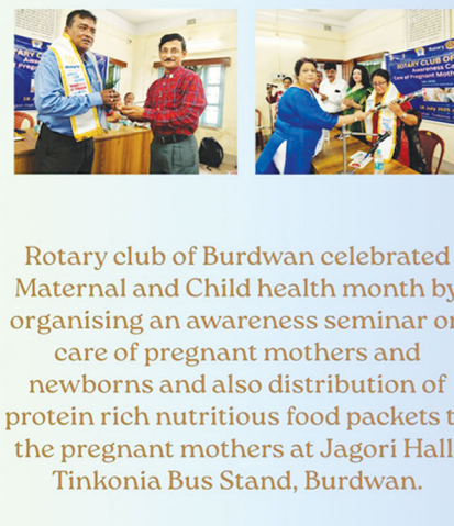
Rotary club of Burdwan