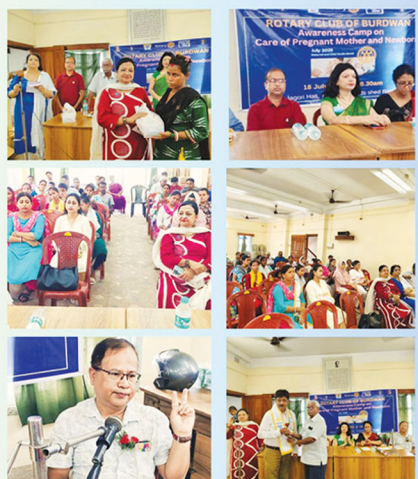
Rotary club of Burdwan