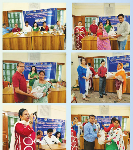
Rotary club of Burdwan