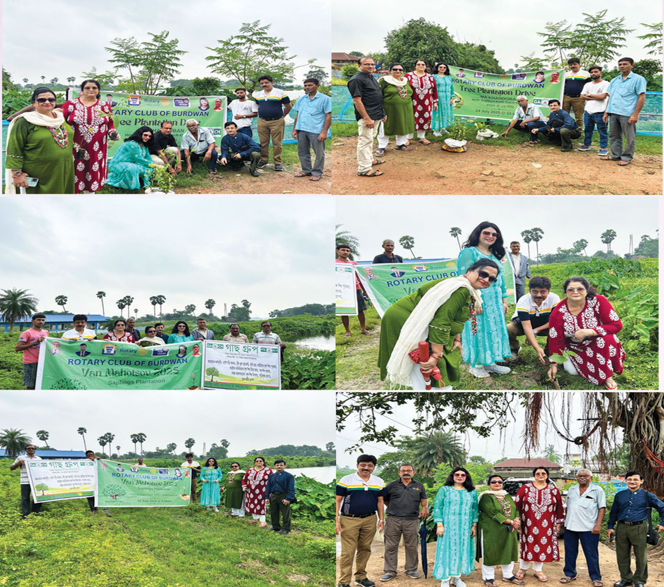
Tree plantation program on 24 th July